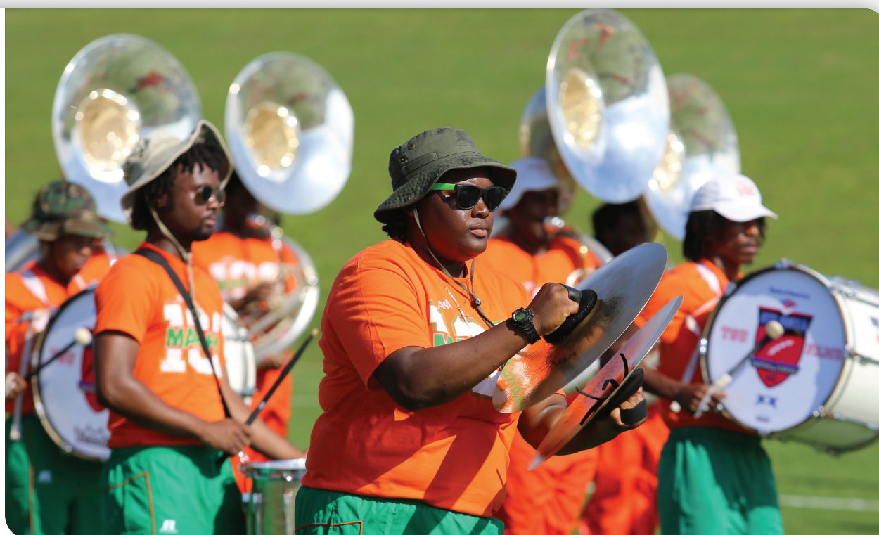
The marching band will have fewer members than in the past, as a result of the new, more rigorous guidelines for participation. The band will make its debut during the halftime show at the MEAC/SWAC Challenge.